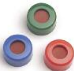
Screw caps with septa