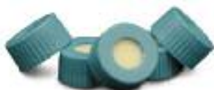
Polypropylene caps with bonded septa, 5185-5823