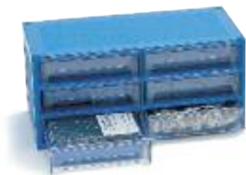
Screw top vial convenience kit