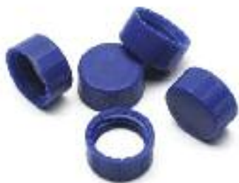
PTFE-lined solid top screw caps for 2 mL vials, 5183-2075