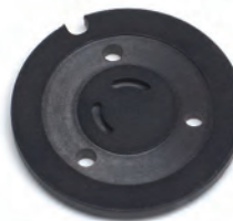
PEEK rotor, low pressure valve (LPV), 8001-0608

The cross references to the original equipment manufacturer (OEM) part numbers listed here serve as a recommendation that the Agilent CrossLab products are viable alternatives to OEM products. CrossLab products are compatible with the corresponding OEM instruments, although in some cases, the CrossLab products may have slightly different designs as compared to the OEM counterparts. All CrossLab supplies are backed by Agilent's 90-day money-back warranty.