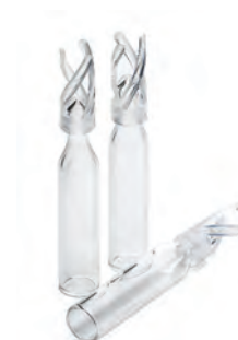
250 µL conical insert with polymer feet, 8010-0131