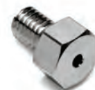
Stainless steel male nut, 1.6 MN, for 1/16 in tubing, 8001-0805