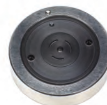
Rotor, 6-port valve, 8001-0601