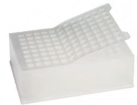
96-well plate with removable sealing mat, 8010-0534

The cross references to the original equipment manufacturer (OEM) part numbers listed here serve as a recommendation that the Agilent CrossLab products are viable alternatives to OEM products. CrossLab products are compatible with the corresponding OEM instruments, although in some cases, the CrossLab products may have slightly different designs as compared to the OEM counterparts. All CrossLab supplies are backed by Agilent's 90-day money-back warranty.