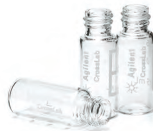
Clear 2 mL standard opening (8 mm) screw top glass vials, 8010-0011