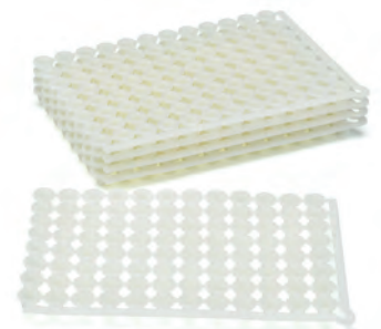
Sealing mat for 0.2 mL 96-well plates, Thermoplastic Elastomers (TPE), 8010-0577