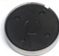
Rotor, 6-port valve, 8001-0606