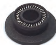
Plunger seal, 8001-0502