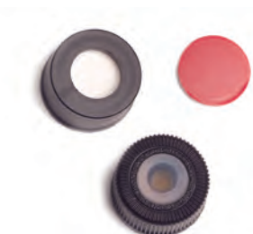
Black screw caps with red PTFE/silicone septa for 4 mL (13 mm) vials, 8010-0095

To obtain an optimal fit and seal of any vial and closure, we strongly recommend buying an entire CrossLab vial assembly (including a vial, cap, and septum, as well as a vial insert if needed). Please avoid mixing and matching any CrossLab vials with any other brand of closures, or any CrossLab closures with any other brand of vials.