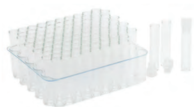
CrossLab vial, snap top shell vial, 1 mL, 8 mm, clear, with polypropylene cap, 8010-0574