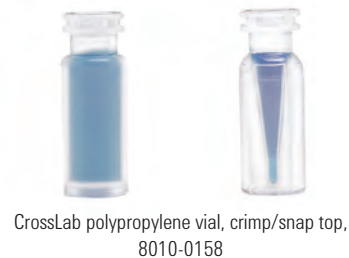
CrossLab polypropylene vial, crimp/snap top, 8010-0158