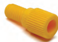
Flangeless nut, M6, 8001-0813