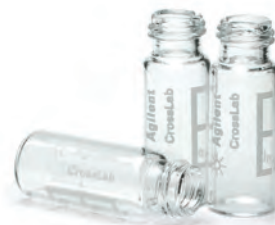
Clear, 2 mL wide opening (9 mm) screw top glass vials, 8010-0015