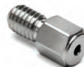
Stainless steel male nut, 1.6 MN, W6 (taller hex portion), 8001-0806