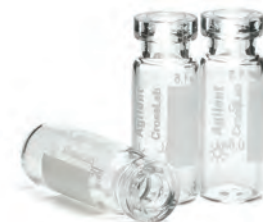
Crimp top glass vials with write-on spot, 8010-0001

To obtain an optimal fit and seal of any vial and closure, we strongly recommend buying an entire CrossLab vial assembly (including a vial, cap, and septum, as well as a vial insert if needed). Please avoid mixing and matching any CrossLab vials with any other brand of closures, or any CrossLab closures with any other brand of vials.