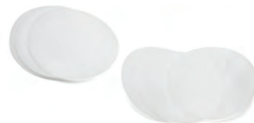
CrossLab vial septa, 22 mm, PTFE/silicone, 8010-0564

Contact your Agilent Authorized Distributor or learn more at www.agilent.com/chem/CrossLabHPLC