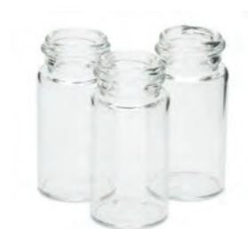
CrossLab vial, screw top, 10 mL, 22 mm, clear, 8010-0563

To obtain an optimal fit and seal of any vial and closure, we strongly recommend buying an entire CrossLab vial assembly (including a vial, cap, and septum, as well as a vial insert if needed). Please avoid mixing and matching any CrossLab vials with any other brand of closures, or any CrossLab closures with any other brand of vials.