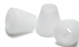
PTFE ferrule, 3.0 F-T, 8001-0803