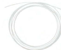
ETFE tubing for use between the inlet block and the check valve, 8001-0807

The cross references to the original equipment manufacturer (OEM) part numbers listed here serve as a recommendation that the Agilent CrossLab products are viable alternatives to OEM products. CrossLab products are compatible with the corresponding OEM instruments, although in some cases, the CrossLab products may have slightly different designs as compared to the OEM counterparts. All CrossLab supplies are backed by Agilent's 90-day money-back warranty.