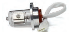
Long-life deuterium lamp, 8001-0702