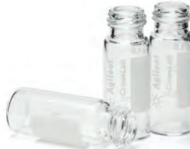
Wide opening screw top vials with write-on spot, 8010-0014