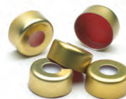
Magnetic crimp caps, 8010-0052

Contact your Agilent Authorized Distributor or learn more at www.agilent.com/chem/CrossLabHPLC