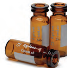
Snap top vials with write-on spot, 8010-0025