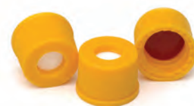
Orange screw caps with PTFE/silicone septa for standard opening vials, 8010-0056