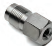
Stainless steel in-line filter, 8001-0808

Contact your Agilent Authorized Distributor or learn more at www.agilent.com/chem/CrossLabHPLC