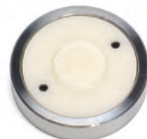
Stator, 6-port valve, 8001-0604